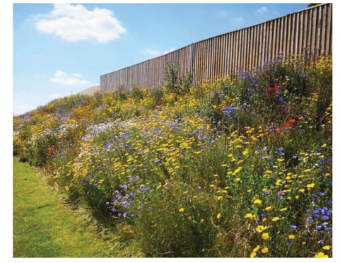
Wildflowers to targeted sections of grass banks and verge