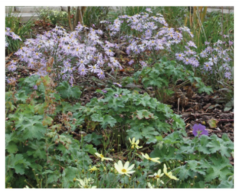
Shade tolerant planting