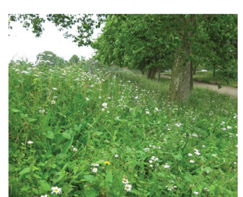
Shade tolerant meadow planting

Potential community growing/allotment space or communal garden