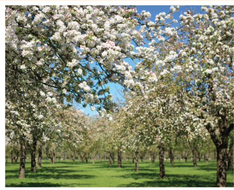
Blossoming tree varieties e.g. Cherry