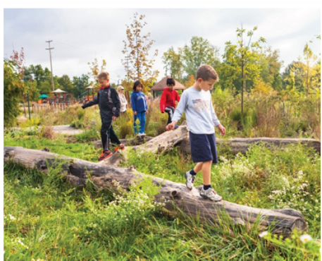
Natural Play Features: Tree trunks