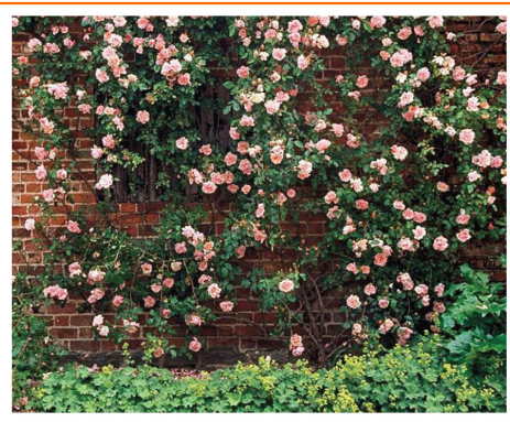
Trellis supported climbing plants to bare walls