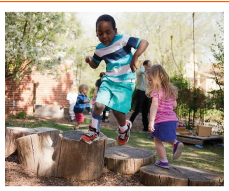
Natural Play Features: Stepping logs