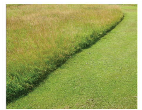
Relaxed mowing to form grass meadow