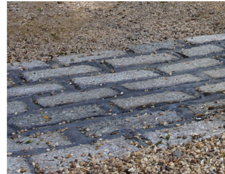
Stone sett thresholds