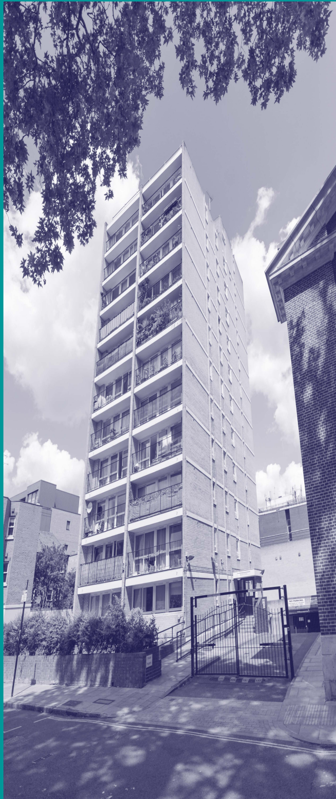
Burnhill House Norman Street London EC1V 3PQ